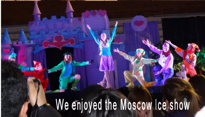
We enjoyed the Moscow Ice show

As we go back we have our inter school sports competition on August 3rd. This is the one cancelled due to rain in July. We have a number of primary schools taking part in this. On the 30th of July we celebrate Friendship day and then on August 15th we celebrate Children's day. The primary pupils also have exams in August...life seems one long exam for them as they have them three times a year from 6 years old.