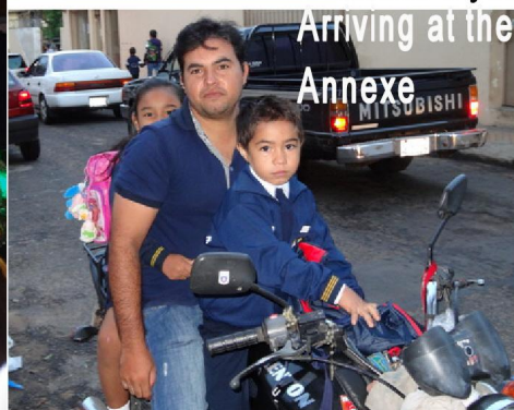
Arriving at the Annexe