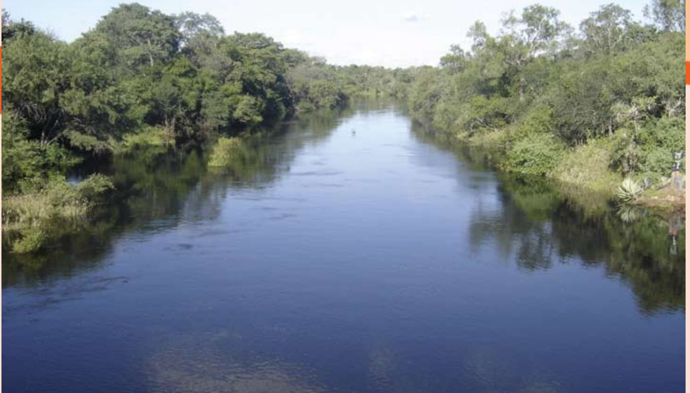
The Rio Verde full again after the dry years

I have had a number of preaching engagements at local churches, but what I seem to have been doing most of all has been attend weddings at the different Enxet churches, ferrying guests to and from them. Enxet weddings are always very colourful events, with the whole community taking part and helping in the preparations. An army of cheerful village women take charge of the large black cooking pots and get the rice and pasta going. The men tend to get the barbecue ready, killing a cow, digging a pit for the fire, and making the wooden spits for the larger pieces of meat. The women cut