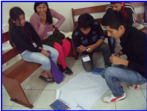
Youth Leader's working in groups at the workshop