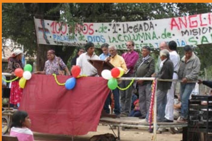
Top: Centenary lunch Bottom: Centenary in Misión Chaqueña