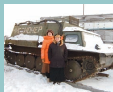
The church's cross country vehicle which is named "The Missionary"!

We left Evensk as soon as we could on the Saturday morning. We reached Magadan with only about 20 minutes to spare to get onto the Vladivostok flight, but we did it alright. It was snowing when we departed and the weather was getting worse. We thankfully got back to Vladivostok that evening!