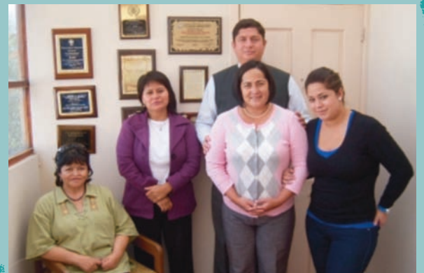
Members of the FLET Team, Ecuador