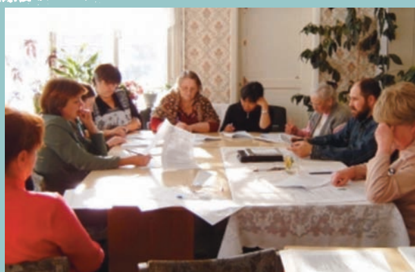
Tutor Training Seminar—Magadan