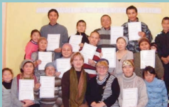
New born tutors at Evensk Church

POSTSCRIPT —To illustrate part of the history of this region, we include two more photos of Magadan. Both are reminders of the tens of thousands of mostly innocent people who suffered and died in the gulag prison camps there during the 1930's, 40's and 50's. On the left is Nagaevo Bay with the quay where prisoners were unloaded from the boats on their way to the prison camps.