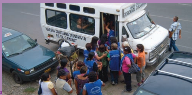
The bus and cars with team going out to support another congregation in door to door visitation. This ministry has recorded five thousand professions of faith.