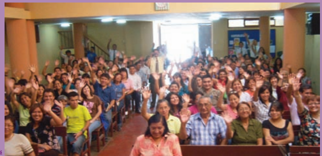
'Jesús es el Camino' congregation (they have a morning congregation and an evening congregation).

Over the past decade, his congregation "Jesús es el Camino" (Jesus is the Way) has grown to over three hundred active and trained members.