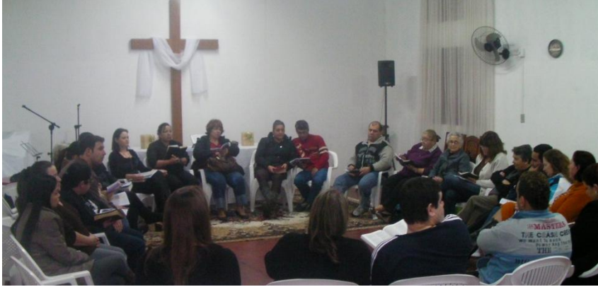
Church Bible study