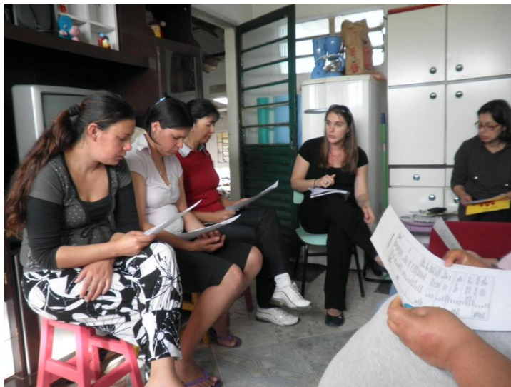
Health talk at Ilha das Flores