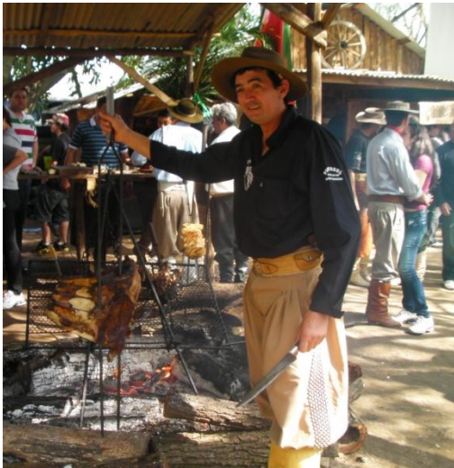
BBQ Gaúcho style!