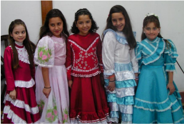
Girls from church dressed in Gaúcho traditional dress