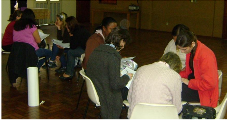
Group work with the orphanage staff