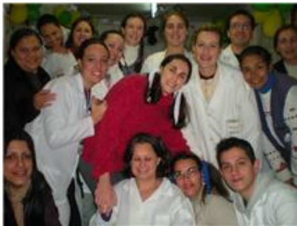
Nursing with the staff at Araça health centre