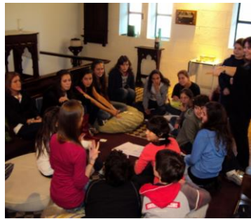
VIVE group meeting