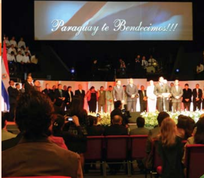
President Franco leads church leaders in a blessing prayer for the nation