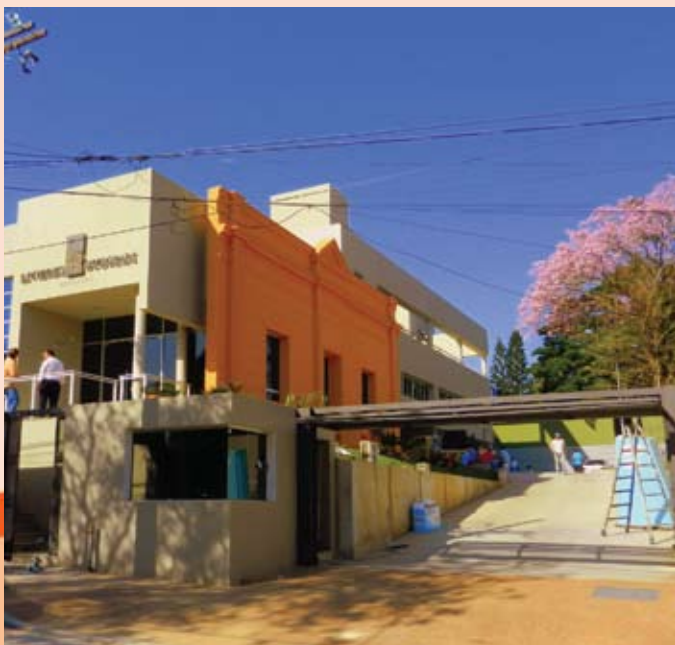
Left: Lapacho tree blossoms, building the old and the new together Right: Sally, Angela and Nancy decorating the altar for the World Prayer Day retreat

Paraguay as a nation is undergoing changes in culture. There is a desire to remain faithful to the traditional but also