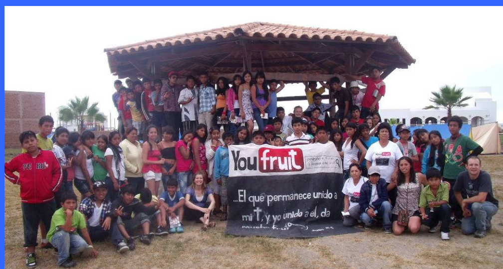
"Youfruit" Summer Camp 2012 – One of three!

are understanding this and beginning to apply it in their lives. We are now adding a further step to this vision – "and bearing good fruit". We want to see young people abiding in Christ and that they learn that a life that abides in Christ implies that you also bear fruit; in love for the Lord, in spiritual growth, in your life's witness, in the church that you attend and in service of your neighbour. Our summer camps have been a good opportunity to share this using verse 5 as the theme of the camp – "He who abides in Me, and I in him, bears much fruit". This summer we have shared wonderful times of blessing with the young people of Lima, Ica, Arequipa and Juliaca. We hope they have returned encouraged and that the word sowed in their hearts will take root and bear fruit.