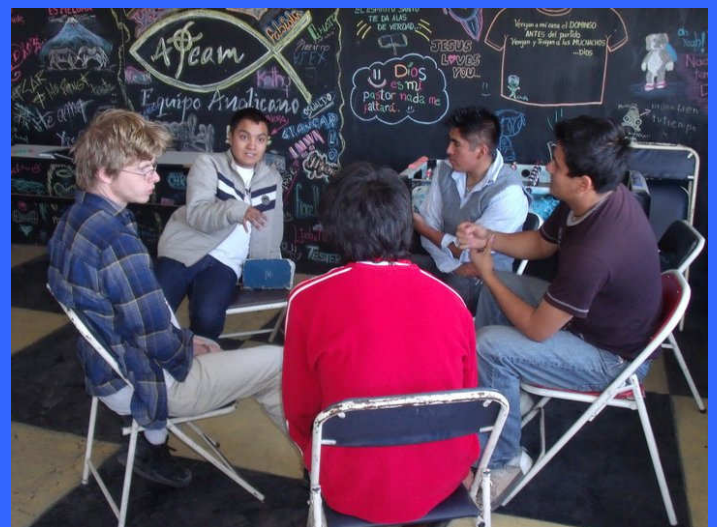
Youth Leader Workshop - Arequipa