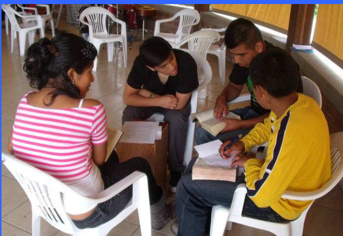
Bible Study: Youth Leader's Retreat