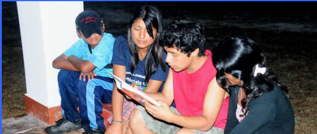
Young people getting into the Bible

each one of us to be a useful and important instrument for Him as part of the team, to be able to listen to the Lord, to abide in Him, to be guided in his purposes for my life and in His service in ministry. I am also praying to God that he will soon put in my path a companion who might be a blessing and accompany me in this adventure of living for Him. I also am praying to have the time to be able to devote to studying to equip me to be able to serve Him better.