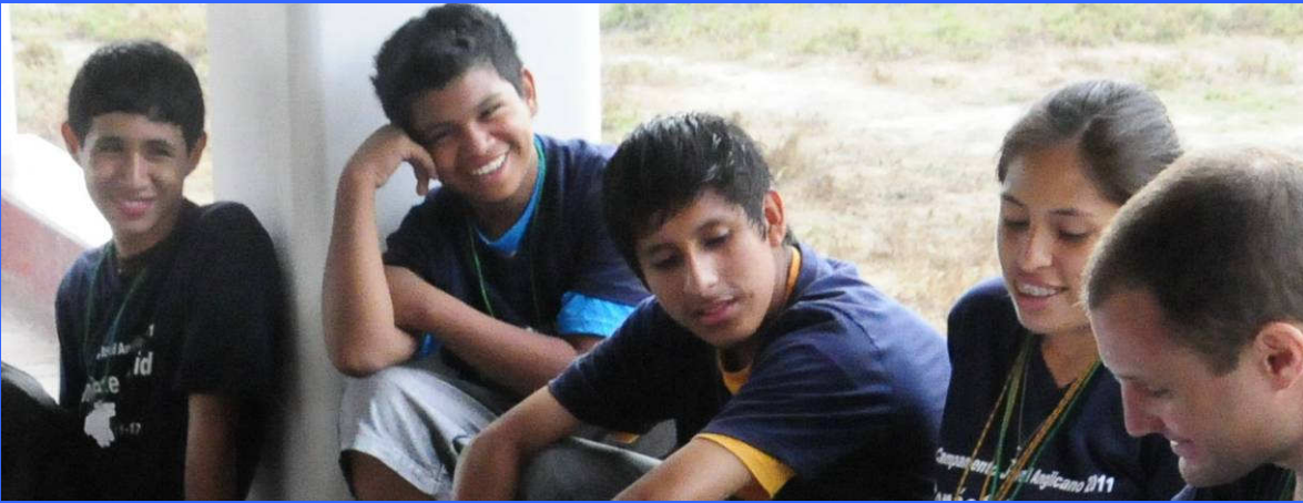
Young Leader Discipleship