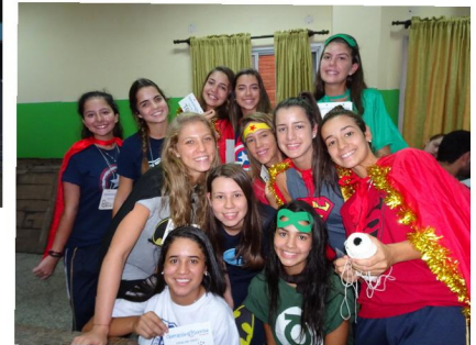
Operation Smile : helping out