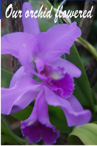
Our orchid flowered