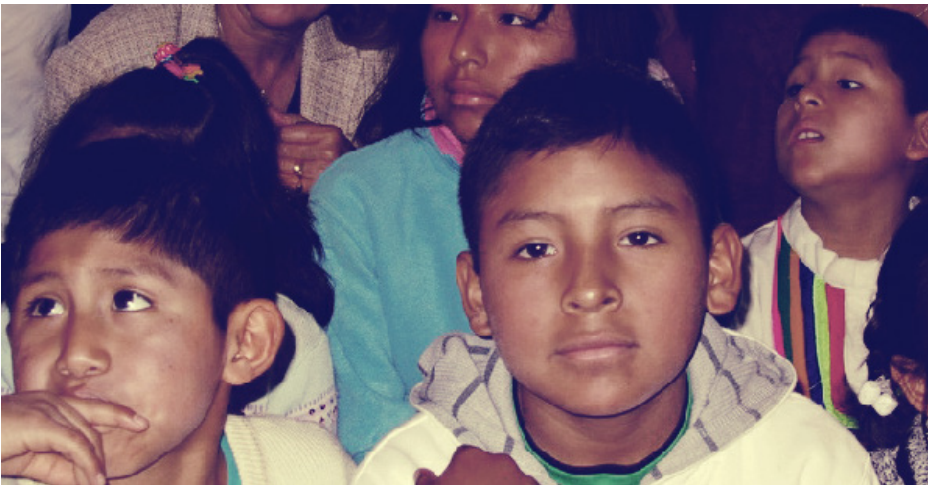
Young people in Lima