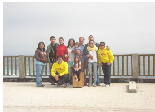
Church planting TEAM