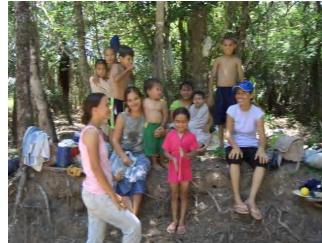
The kids at the river