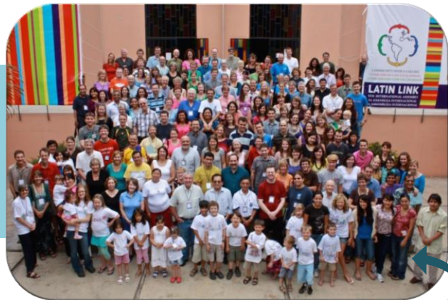
Latin Link International Assembly 2010 Peru.

The situation is really sad. Thousands of families have been left homeless and live in tents in the streets without electricity or running water. Many churches have also been completely destroyed.