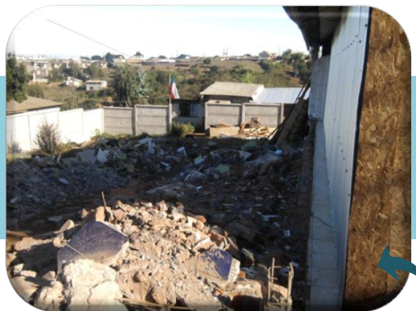
Chile. There used to be a church here. Now it is just rubble.