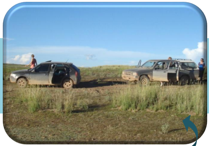
Stuck in the middle of nowhere in Bolivia