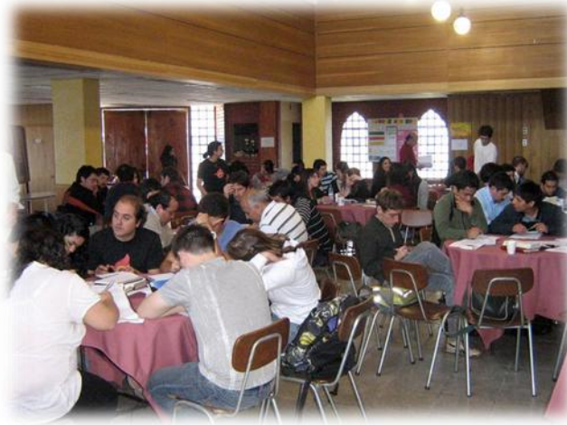
CHALLENGE CONFERENCE 2010