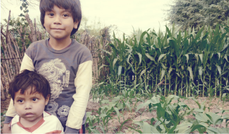
Young Wichi boys in their family garden plot