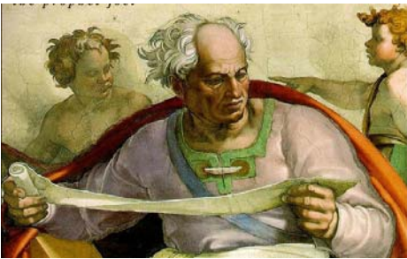
Qom le'ec – Qoje le'ec