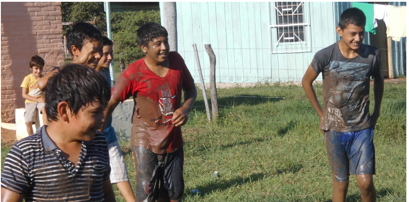
Some of the young people at a youth evangelistic event in an area of Concepcion called Ramonita.

Thank you for your partnership in mission!