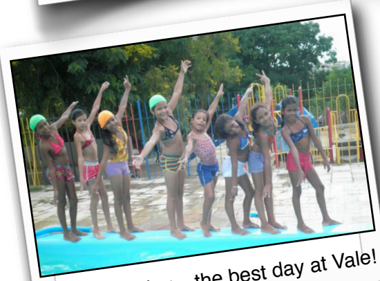
swimming day ...the best day at Vale!

The 3rd EBA at Vale to which I took my small group, went really well and all the teens heard about Gods love for them! There was real mix of learning and fun and games all relating to the theme of "Being different" and how you live your life differently in this day and age! This culminated in the last day's wide game. We had to better last year's and so this year we went all out for gross and fear!! There was a tunnel with chicken bits and live toads, to wading through the river and foot deep mud and then the house of terror! Was alot of fun, even wading through the mud when we were mapping it all out! In the actual game, I was the corpse in the dark, in the house of terror and was holding the last pass they needed to collect to finish the course! Some of them thought I was a doll, 'cos my face was painted white to disguise who it was and I didn't move until they tried to extract the pass from my hand! Was alot of fun! I knew I wouldn't get any sleep during this time and I was correct!!