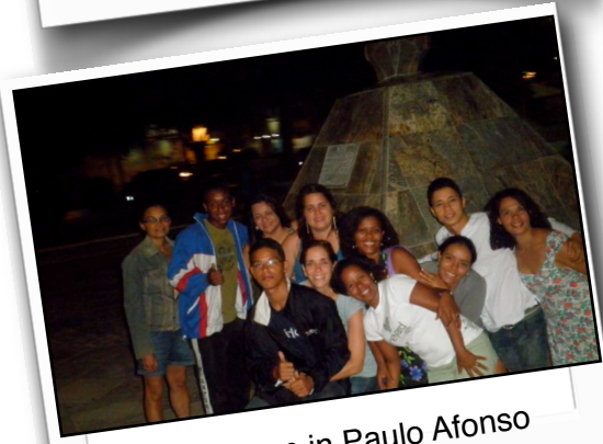
Church camp in Paulo Afonso

Our Easter celebrations were limited to one afternoon, as we really do not have any funds, so just one afternoon was to reduce costs! The adolescents did 4 dramas about Easter, one in particular was amazingly powerful! The girls from the morning did a dance/mime and the girls from the afternoon did a dance too ...and then there was the littlies!! I really wish I could put the video I recorded on FB to show everyone, 'cos it was so cute and usual mayhem with 4-5 year olds!