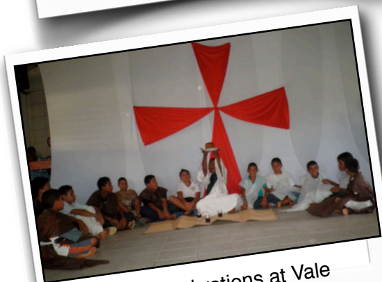
Easter celebrations at Vale

Talking of no sleep ... During carnival our church went on a road trip to Paulo Afonso, Bahia (another state, approx 6-7 hours away by car) as there is a small Vineyard group there who we as a church are helping, so we all went to meet them! We set off at 01:15 to avoid traffic and were scheduled to arrive at 07:30, however this was without any hiccups! At 04:30 the bus broke down, in the middle of no-where! OK, it was near a very small village that was dead! Here we waited 6 hours for another bus to take us the rest of the way! When it arrived we had to unload everything and reload the new bus! I didn't sleep the entire journey! For fotos, see my FB page!