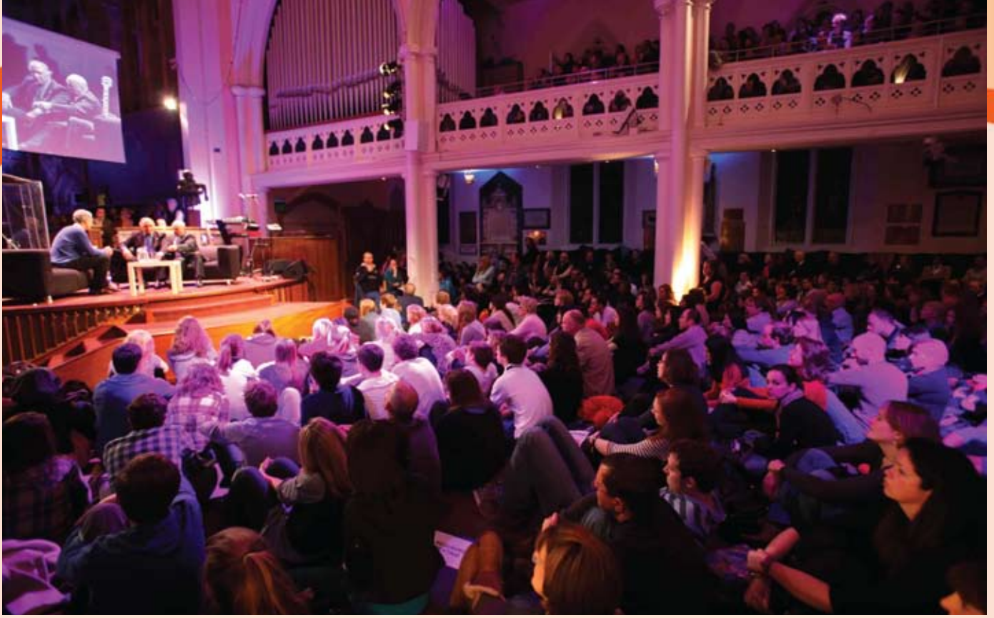
At Holy Trinity Brompton Church, London