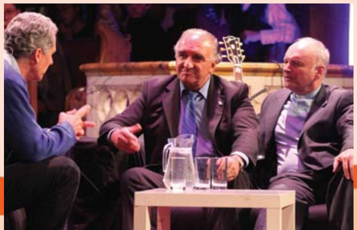
Below: Being interviewed on stage