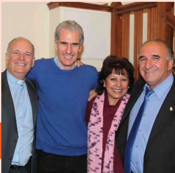
Left: With Nicky Gumbel

We have now been invited to Rick Warren's Saddleback church and the Crystal Cathedral in the US, as well as a couple more Prayer Breakfasts. This was the result of our surprise visit to Washington. I was halfway through a Marriage Preparation before leaving Chile when we were received an invitation (an invitation that we could not refuse!) to the National Prayer Breakfast where President Obama would attend with his wife Michelle.