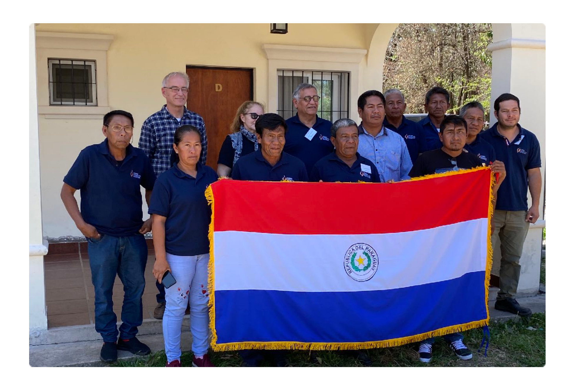
Day 22 - Theme: Media and Technology

Intercede for the effective use of media and technology in advancing the Kingdom of God in South America. Pray that local churches would harness these tools to share the Gospel widely, disciple believers, and foster community across geographical boundaries.