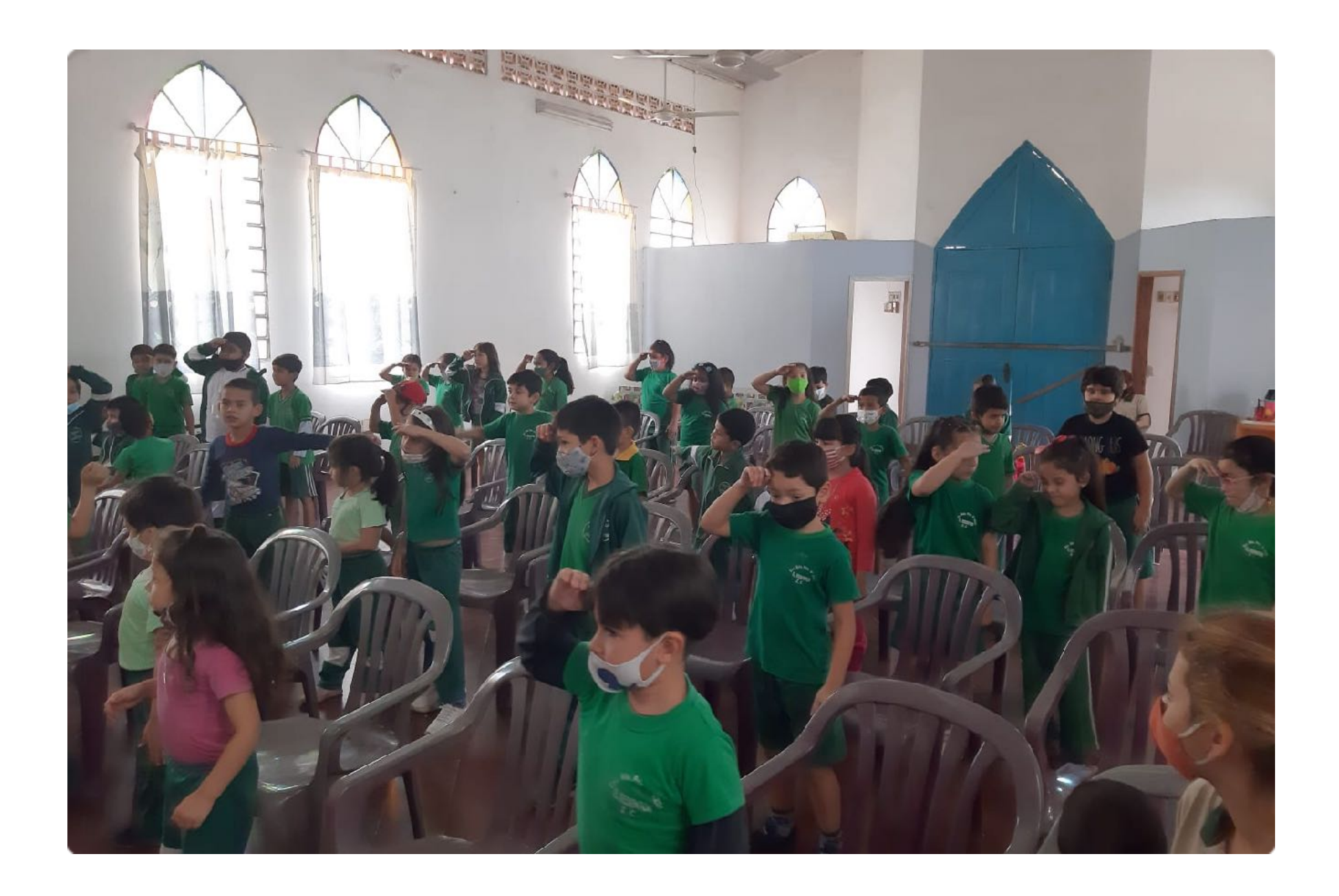
Day 31 - Theme: Thanksgiving and Praise

Pray for a renewed sense of hope and restoration to permeate the hearts of people in South America. May they encounter the life-transforming power of the Gospel, experience God's love, and find true purpose and meaning in their lives.