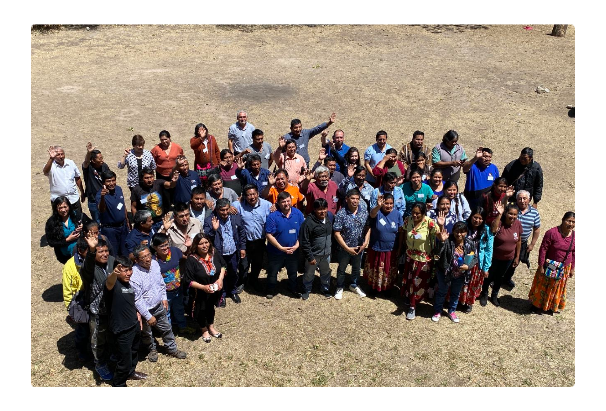
Day 5 - Theme: Discipleship

Today, let us intercede for the growth and maturity of new believers in South America. Pray that they would be rooted in the Word, guided by the Holy Spirit, and mentored by experienced disciples. May they become strong disciples themselves, carrying the Gospel forward.