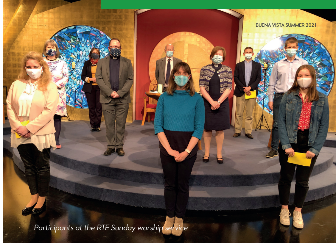
Participants at the RTE Sunday worship service

SAMS Ireland is part of the Association of Mission Societies (AMS) of the Church of Ireland. AMS had the opportunity to join with