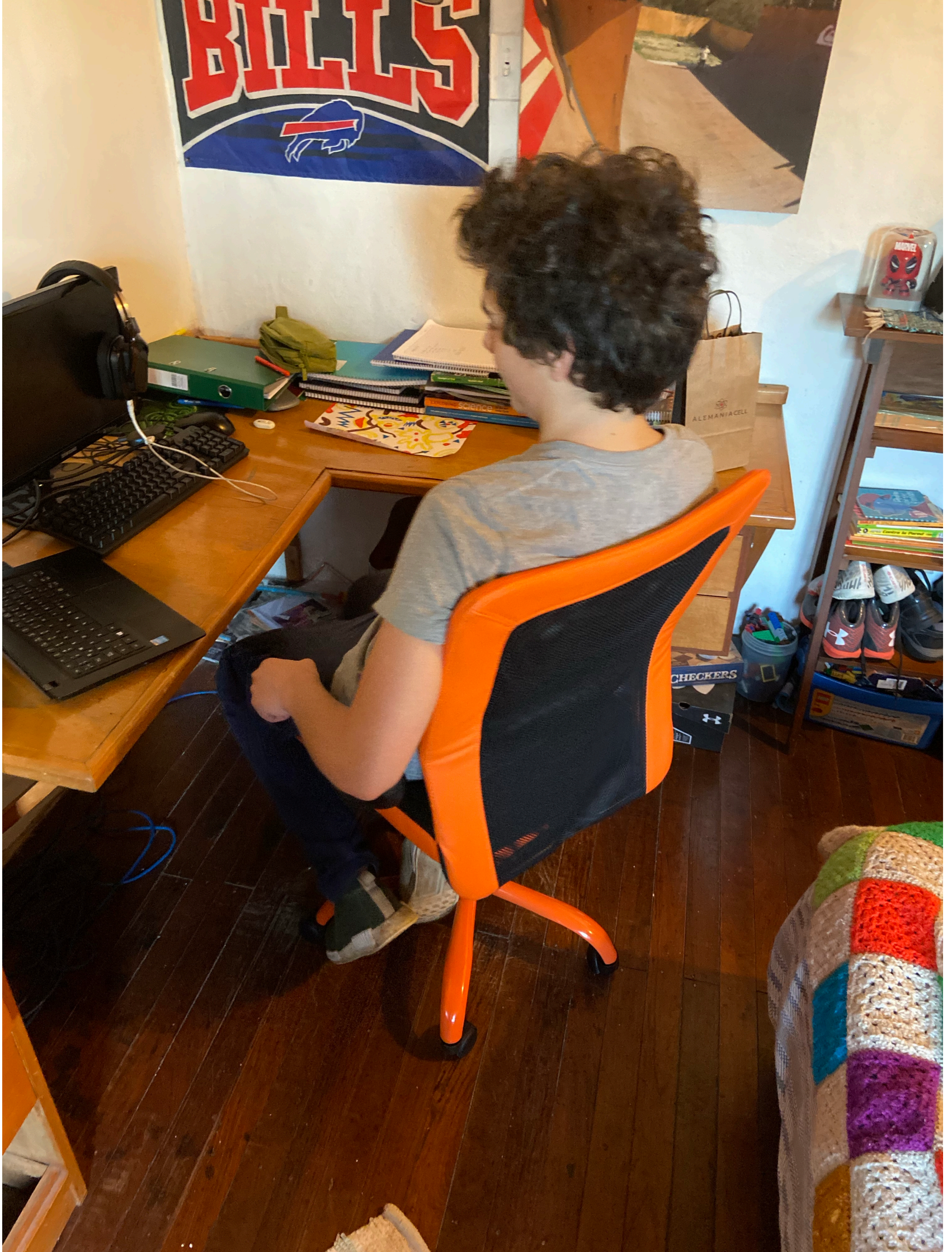
New place for classes (his room)