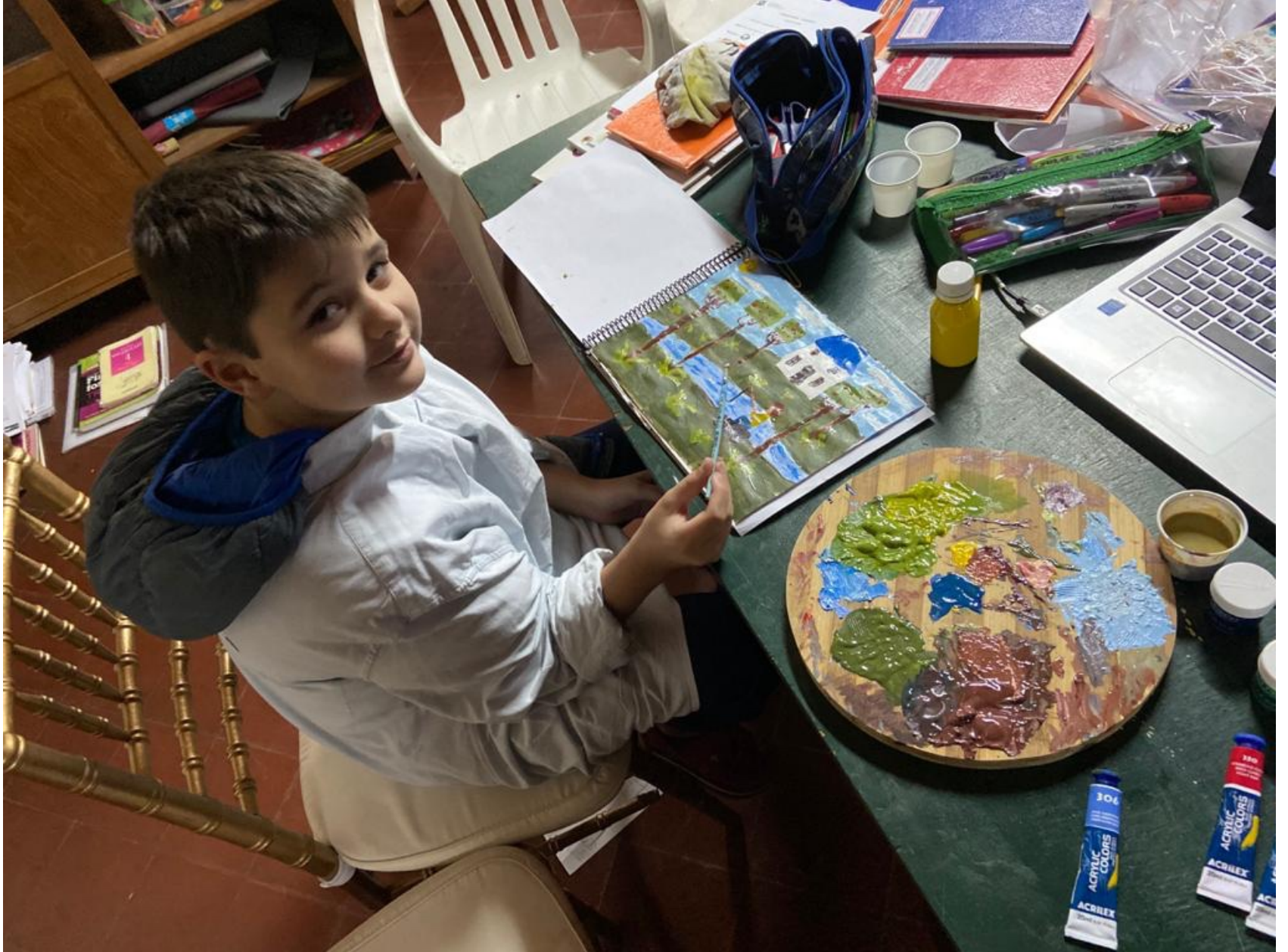
Art in progress