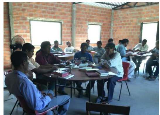
A training session for local pastors at the education centre at Rio Verde

We give thanks that last year 620 people were confirmed in La Patria community.