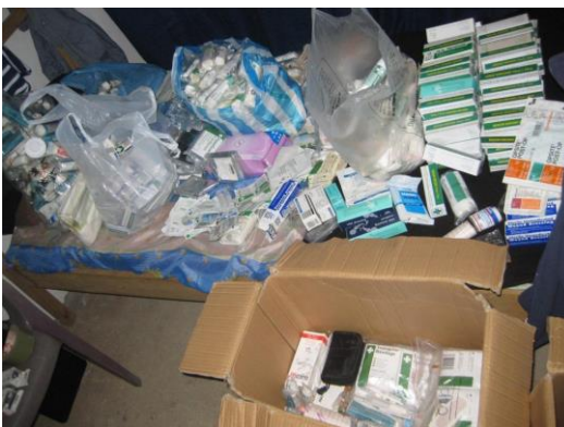
A consignment of medical items for distribution

The last consignment of clothes, medical items and second-hand spectacles from Mission Paraguay, transported with the help of the Scottish Fire and Rescue Service, arrived in Paraguay at the end of 2018 and has now been distributed to needy families. To date over 8,000 pairs of spectacles have been provided for people unable to afford to visit an optician. We are grateful to Silvia Torres who lives in Paraguay. Silvia provides valuable assistance in collecting and arranging distribution of all items sent via containers and supporting volunteer teams in very many ways. Thanks are also due to Bishop Peter Bartlett and members of the Anglican Church in Paraguay for their hospitality and support and to Rev. Stephen McElhinney and colleagues at SAMS Ireland for their encouragement and work in managing our funds.