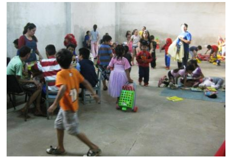
The toy library in operation

For several years we have funded the toy library operating from FEISA the Anglican teacher training college based in Asunción. On a regular basis the toy library visits different communities on the outskirts of the city to enable children with few toys of their own the opportunity to learn through play, hear Bible stories and learn about Jesus. We are committed to continue to fund the toy library throughout 2020.