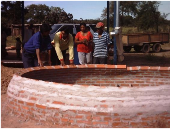
An underground rainwater storage tank under construction behind a new church being built in the Chaco