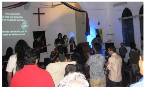
A youth service at Zeballos Cue, Asunción