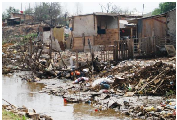
Housing on the side of the small river behind Rocio's home

The last consignment of clothes, medical items and second-hand spectacles from Mission Paraguay, transported with the help of the Scottish Fire and Rescue Service, arrived in Paraguay at the end of 2018 and has now been distributed to needy families. To date over 8,000 pairs of spectacles have been provided for people unable to afford to visit an optician. We are grateful to Silvia Torres who lives in Paraguay. Silvia provides valuable assistance in collecting and arranging distribution of all items sent via containers and supporting volunteer teams in very many ways. Thanks are also due to Bishop Peter Bartlett and members of the Anglican Church in Paraguay for their hospitality and support and to Rev. Stephen McElhinney and colleagues at SAMS Ireland for their encouragement and work in managing our funds.