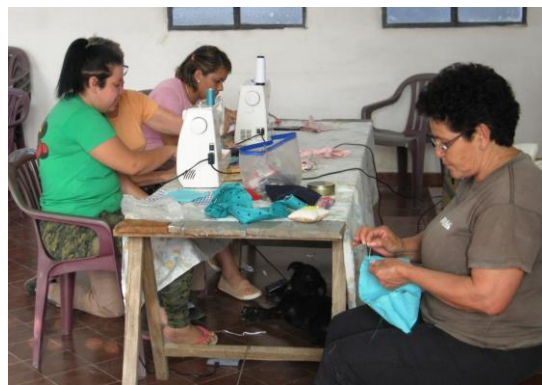
A church based sewing workshop