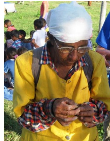
An Indian lady threads a needle to aid her spectacle selection

Accommodation for volunteer teams is provided by local churches and communities thus enabling the formation of friendships which cross language and cultural divides. Working together provides mutual support and interdependence. Mission Paraguay is not just about providing resources and help it is very much about building relationships, changing lives and strengthening Christian faith.