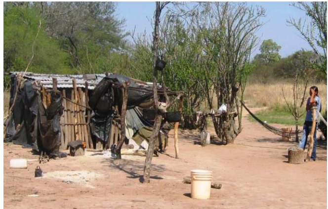
An Indian home in the Chaco. A new brick house was provided for the family

Over recent years our work has broadened considerably to utilise the specific skills and expertise of volunteers to react to specific needs and requests including: