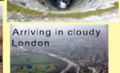
Arriving in cloudy London