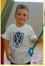
The first 3rd Generation pupil started school.

The girls' football team did very well in the fist competition of the year but the boys recovered last week.