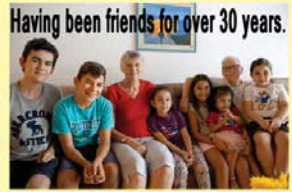
Having been friends for over 30 years.