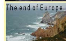
The end of Europe