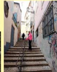
Lots of steps up to the cat's earned an acronym made into a frown