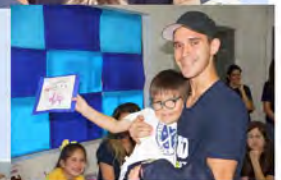
Praying for the kids