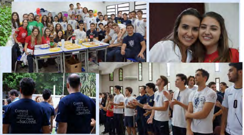
The parents chose a verse for their Tshirts

They came back to school on Thursday afternoon where the 7th grade gave them a farewell party and then there was a special service for them with the whole of secondary in the cathedral. Their parents were invited to that too. The next day was their last day.