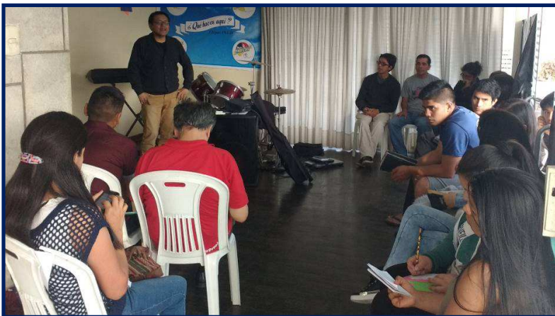
Teaching at the Youth Leader's Retreat

Before we left Peru for the UK there was plenty happening. A few highlights are included below: