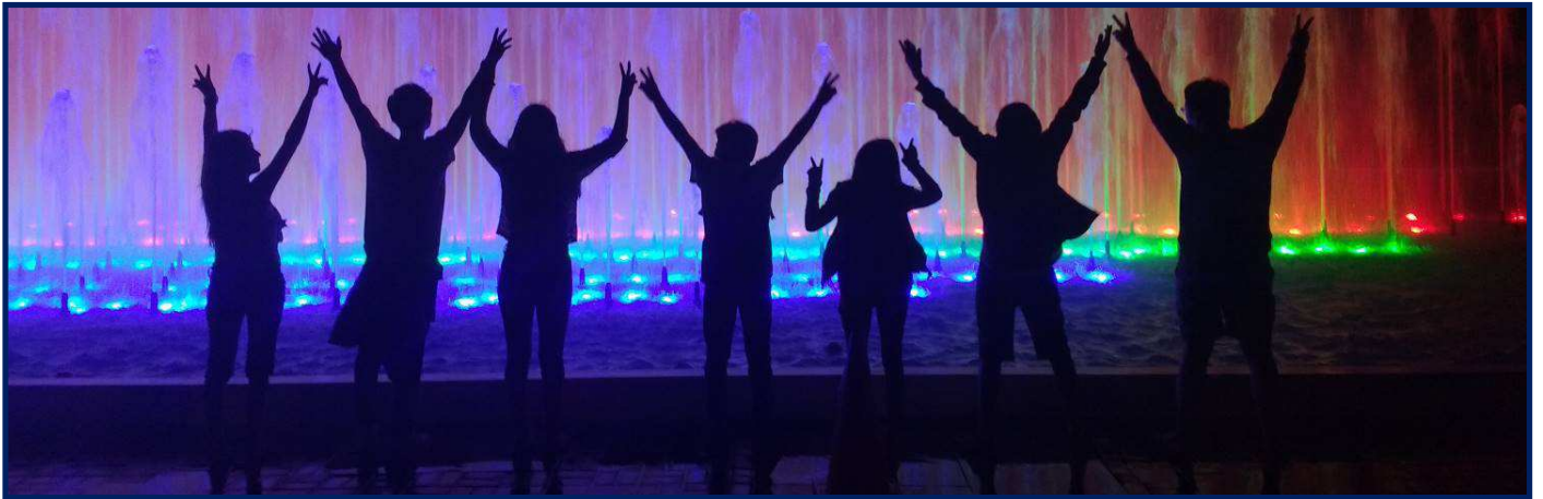
Young people from the San Pablo mission enjoy a trip to Lima’s fountain park as part of their Christmas celebrations

Advent was a time for presenting the results of our discipleship visits around the diocese. Although challenging for all concerned this has led to reflection and repentance as a church and the beginnings of change – something we will be working on as a discipleship team, and as a church, in the next couple of years. Christmas celebrations included trips out for youth groups (see photo above), Christmas services with the nativity story in many different forms, Christmas meals and it was particularly special to see young people from San Juan Evangelista giving from the little they have and sharing it with those less fortunate – they prepared Christmas hampers for the families of young people with severe mental health needs.