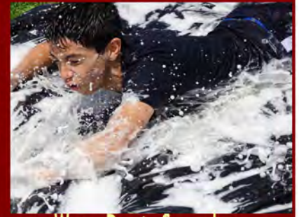
Water Day in Secondary

We were amazed by the rainbow around the Sun.