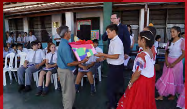
A mum from the Annexe died giving birth to a 4th child. The classmates of the older one collected food and money to help the family.