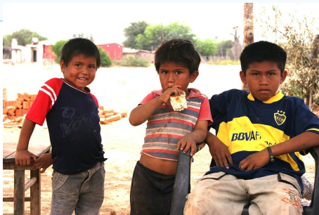
Young onlookers, El Churcal