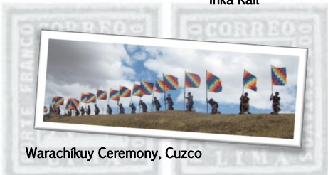
Warachikuy Ceremony, Cuzco

I celebrated completing my first year here at the annual Family Festival, which was how I spent my first full day in Peru last year. It was a good day when all our churches in South Lima come together. I helped with the Bazaar. I generally am more accustomed to how things work here, although I still have moments which catch me out - it has been surprisingly difficult decorating my new bedroom including incidents with a tin of emulsion paint (I won) & a Peruvian flat-pack shelving unit (I won). Scandinavian instructions suddenly seemed so easy by comparison.