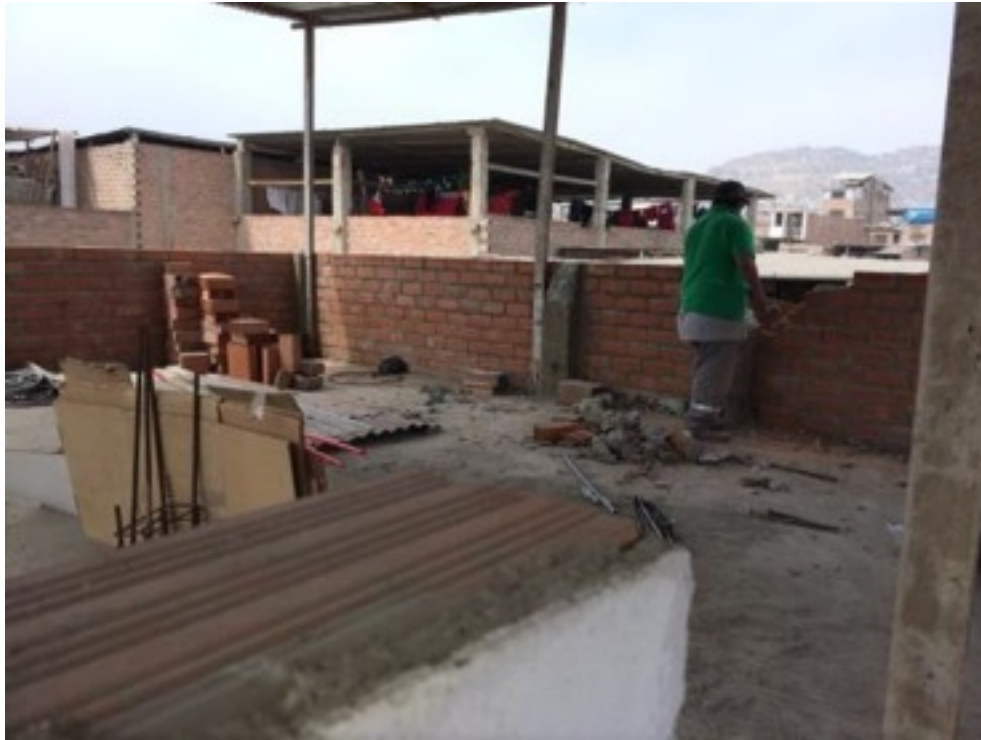
The builder working on the rooms at the back of the house

We have to improve and change the ceilings which remain in the front of the house, since they are very old in construction and we have to place new columns which are very secure and strong, ceilings and floors and toilets and windows and much to repair. All this costs a lot of money I know, but it is something we just have to do to safeguard the life of the children and to continue with the work of the school helping the most needy and weak and unprotected and the children who are the most vulnerable.