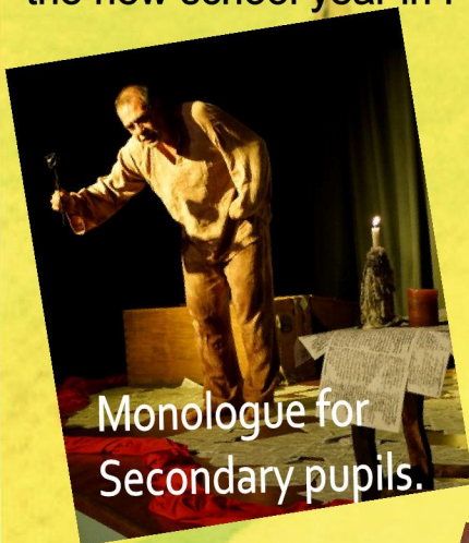
Monologue for Secondary pupils.

Splash took part in a dog show last Sunday. He did very well and got his champion certificates but was beaten by an American Cocker Spaniel with a lot of hair.