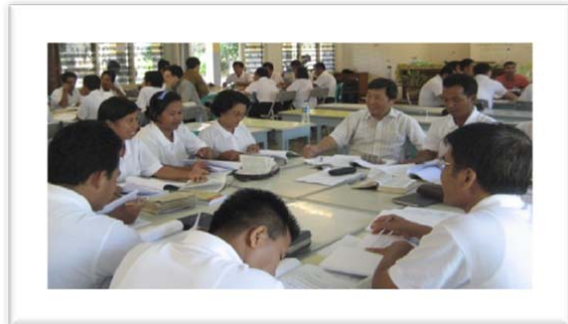
SEAN students, Indonesia