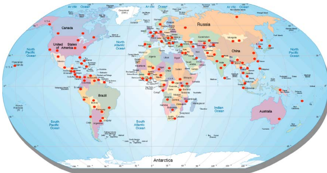
SEAN PROGRAMMES AROUND THE WORLD

SEAN is a grassroots Christian charity. Our vision is to see... "Local churches, worldwide, empowering and equipping all their members for whole life discipleship, mission and ministry in their context."