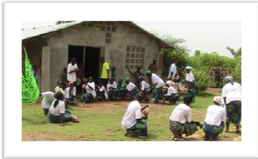
SEAN students, Liberia