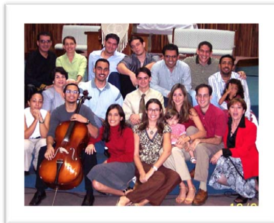
SEAN Students, Puerto Rico