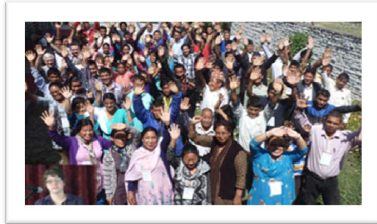
Leaders Conference, Nepal