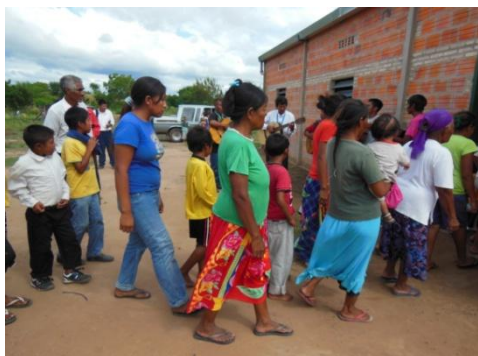
Christ the Saviour Church, La Paciencia