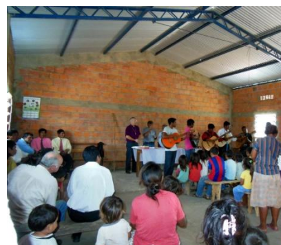
Consecration of the new church