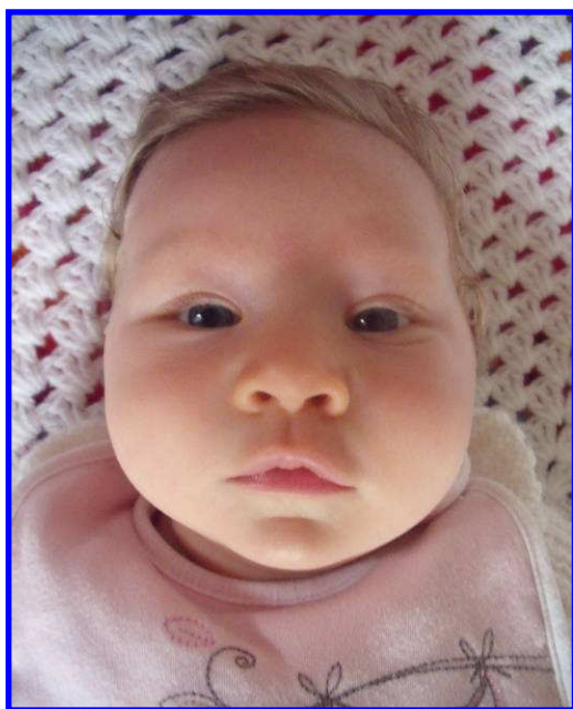
The current star of the show, wherever she goes!