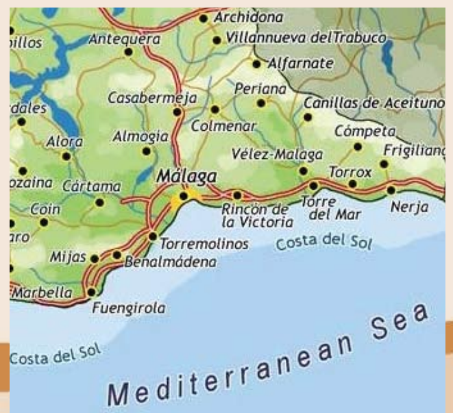
Map of Torremolinos