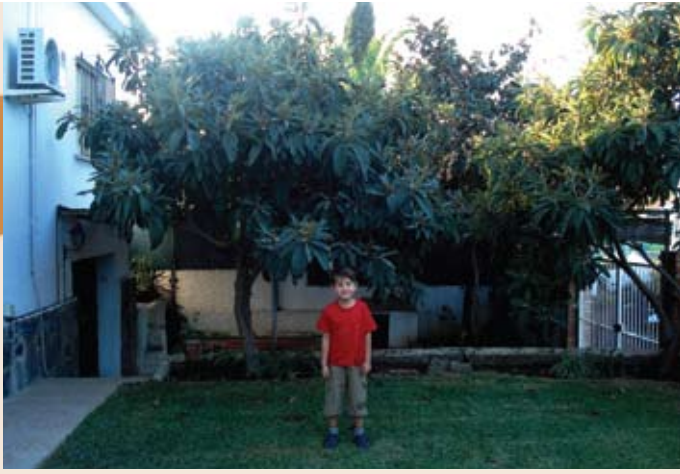
Our new home

part of the year that God was probably leading us out of both the Centro Cultural and church, La Puerta, where we had been involved for two years. In May, in agreement with CMS and SAMS, it was decided that we should offer our resignation to both the project and church, although stating our desire to stay within the church informally. Unfortunately, we were unable to do this and so by the end of May found our involvement in both coming to an end.