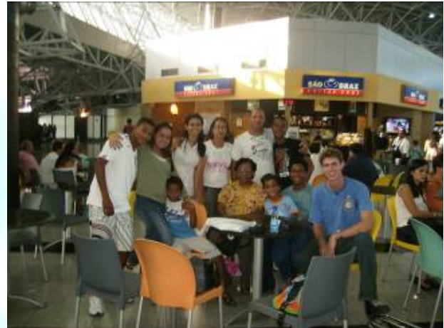
Saying goodbye at Recife airport

difference between the city and the country where one should greet ones fellow day trippers in the countryside but I think that's rubbish. Just choose will you, either be nice and friendly to all or not at all! ☺ This country!