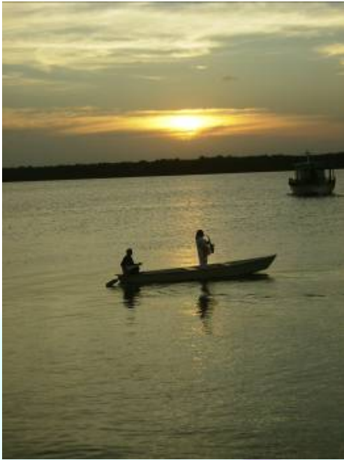
Watching the sun set listening to a guy playing saxophone from a boat in Joao Pessoa

I had to fulfil a few SAMS commitments within the first week including a full medical and a psychological test (!?) both of which I passed fine!