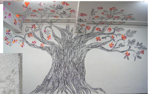
The tree of San Andres : made up of the names of all the ex-pupils.