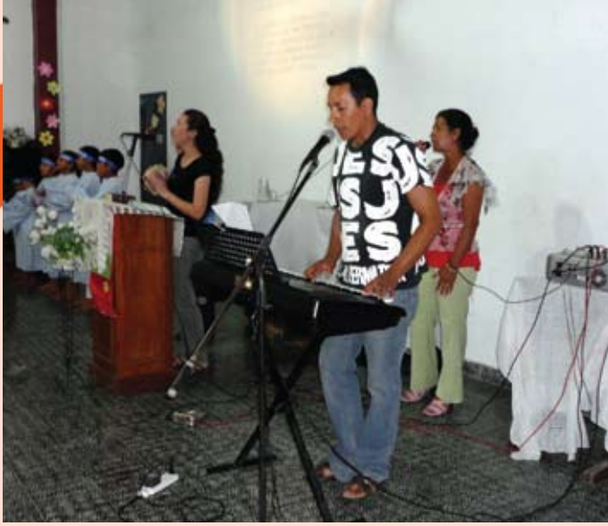
Worship at the 'King of kings' church