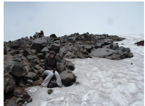
Can you see me at the top of the volcano?

Houses are very different here. They are small and often cold at night as they do not have any heating.