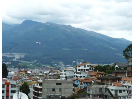
Quito. Lots of houses built close together and mountains in the background.

Houses are very different here. They are small and often cold at night as they do not have any heating.