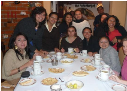
Lady in the red T-shirt was my Spanish teacher.

In the last newsletter I told you about some of the big mountains here. I have climbed a volcano. The volcano was so tall. I had to walk very slowly because the air was very different that high up.