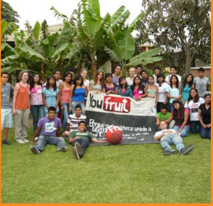
Top: Young leaders at Misión Jesús Fuente de Vida